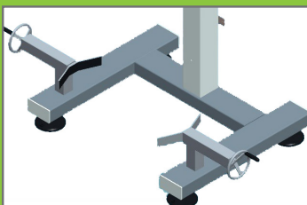
Dual spindle clamping (+031)